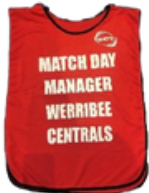
JUNIOR MATCH MANAGER