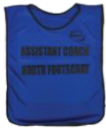
JUNIOR ASSISTANT COACH