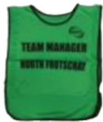
JUNIOR TEAM MANAGER