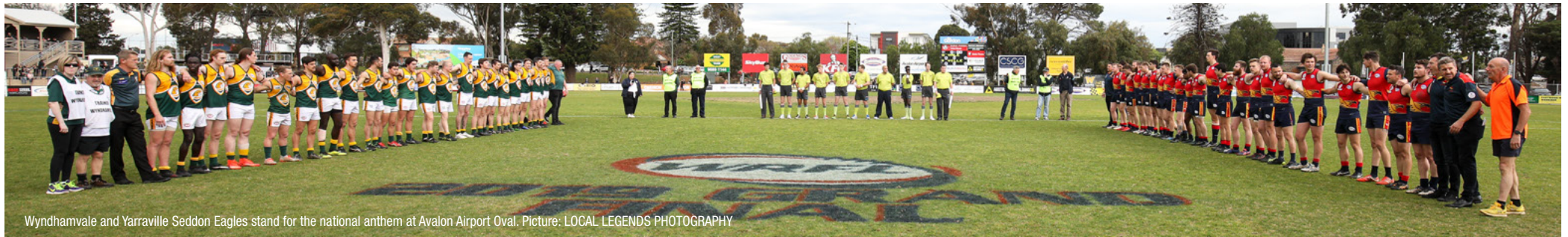
Wyndhamvale and Yarraville Seddon Eagles stand for the national anthem at Avalon Airport Oval.