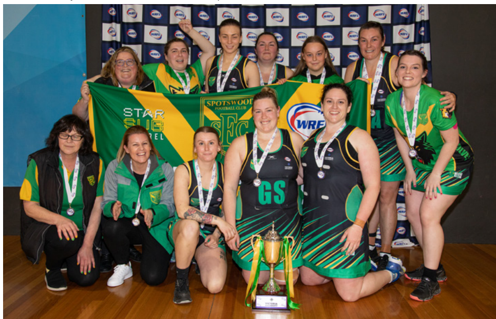
Victoria University WRFL Netball Division 2 Premiership team, Spotswood.