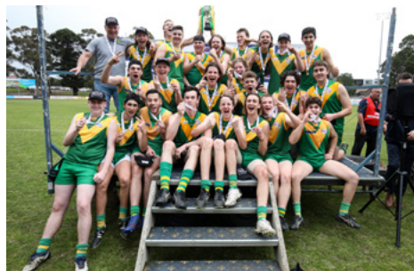
Spotswood defeated Point Cook to win the TIV Under 18 Division 2 Premiership.