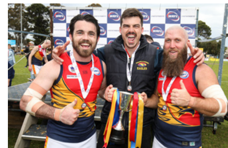
The Yarraville Seddon Eagles won their fourth straight Division 2 Reserves premiership.