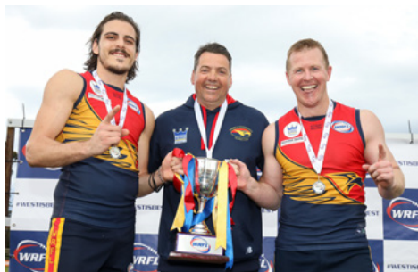
The Yarraville Seddon Eagles defeated Wyndhamvale to win the Division 2 Senior Premiership.