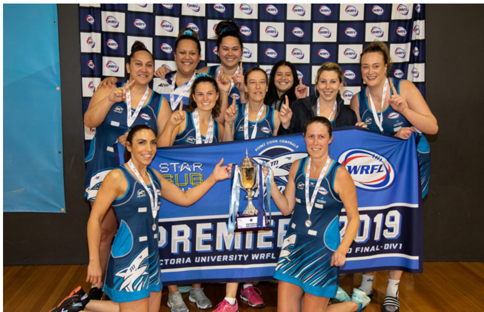
Victoria University WRFL Netball Division 1 Premiership team, Point Cook Centrals.