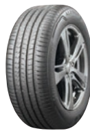
ALENZA Luxury SUV

We are proud official sponsors of the WRFL