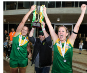
Spotswood defeated Caroline Springs by 11-points to win the 2019 Victoria University Polytechnic Senior Women's Premiership.