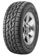
DUELER 4x4 and SUV