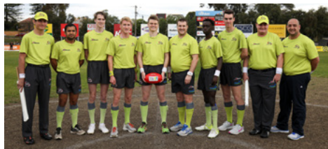
WRFL Umpires ready to officiate the Division 2 Senior Grand Final.