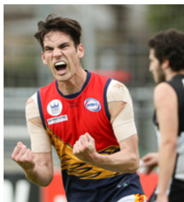
The Eagles celebrate a big day at Avalon Airport Oval on Sunday.