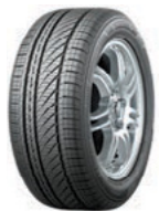
TURANZA Luxury Touring

Bridgestone is the market leading tyre company is recognised around the world for its products and services, which combine the very best in performance, safety and quality.