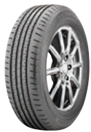
ECOPIA Fuel Saving