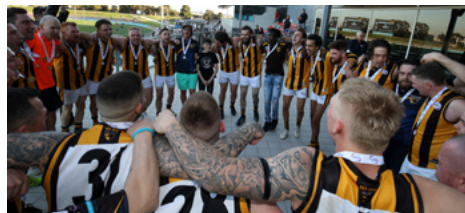
Glen Orden sing the song after their Grand Final victory.