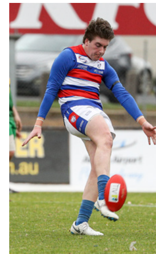
A Point Cook young gun gets a kick away in the Grand Final.