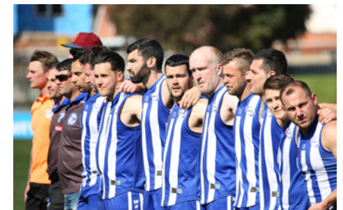
Albanvale line-up for the national anthem ahead of the Division 3 Grand Final.