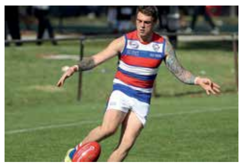
Point Cook is through to the Division 2 Grand Final after defeating Parkside in the Preliminary Final.

The Grand Final will be played at Avalon Airport Oval in Werribee at 2.15pm on Sunday.