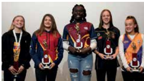
Werribee Football Club Under 15 Division 2 Girls Best and Fairest Award winners