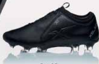
Jet 18 Black/Black

Boots will be shipped direct within 10 days of order placement