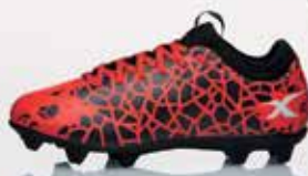
Animal Junior 18 Red/Nine Iron Grey