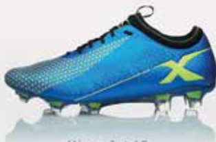
Micro Jet 18 Blue/Volt