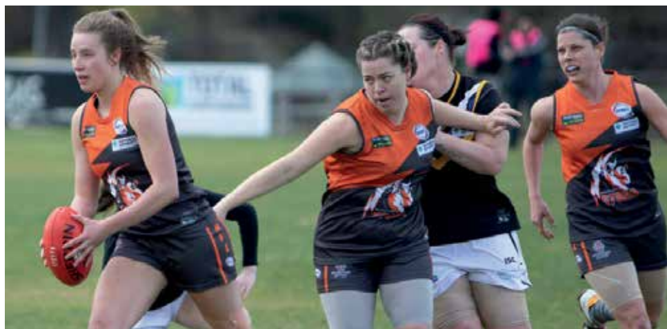
Manor Lakes defeated Caroline Springs to book their spot in the Victoria University Polytechnic Senior Women's Grand Final.

They will take on Caroline Springs at VU Whitten Oval on Saturday.