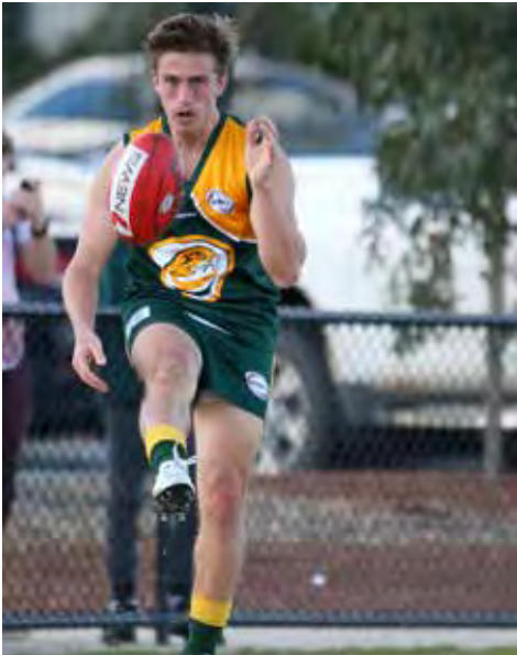
The last time Wyndhamvale played Spotswood, they scored a win. They two clubs go head-to-head today.