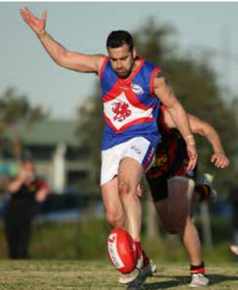
Sunshine Heights scored an impressive win against Tarneit at the weekend. They take on Braybrook today.