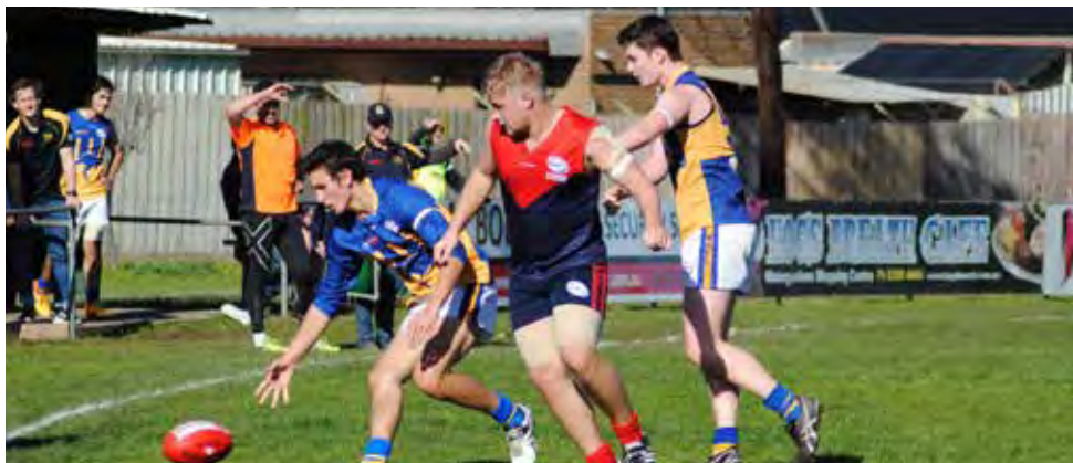
St Albans and Sunshine reserves players got behind the themed round of footy.