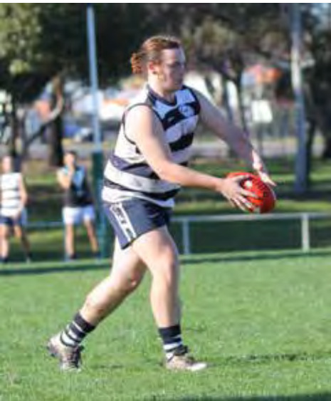
A big second half from Albion secured their eighth straight win.

Albion had 10 different goal scorers, with James Leach the best of the lot, he booted four goals.