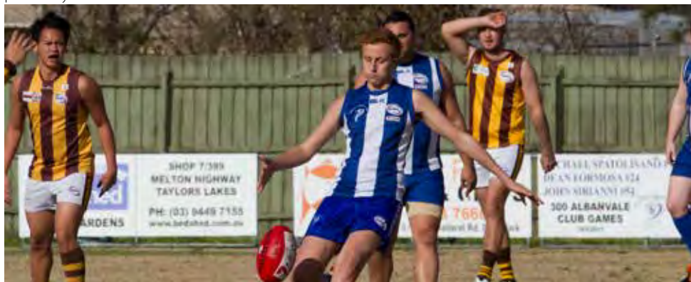
Albanvale scored its fifth win of the season against West Footscray at the weekend.

Finally, the Yarraville Seddon Eagles will head into its Round 15 match as favourites when they take on West Footscray at Yarraville Oval.