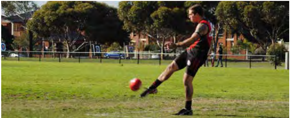
Sunshine Heights scored an impressive win against Tarneit at the weekend. They take on Braybrook today.

The Bombers registered their second biggest score in 2016 and after numerous losses in excess of 100 points; this game could spark some real motivation for the team.