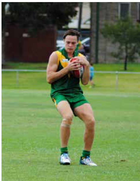
Spotswood celebrated a win against Altona at McLean Reserve on Saturday.

Deer Park host Altona at John McLeod Reserve and Werribee Districts play Yarraville Seddon at Yarraville Oval.