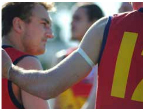
Yarraville Seddon Eagles seniors and reserves players all wore white armbands.