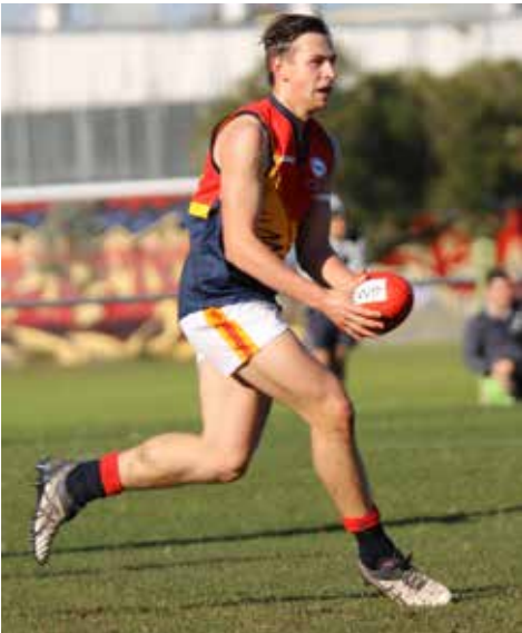
Yarraville Seddon Eagles scored an important win against North Footscray, giving them top spot on the ladder.

The loss was just North Footscray's second of the season, yet they dropped from first to third after Caroline Springs also leapfrogged them after their win over Manor Lakes.