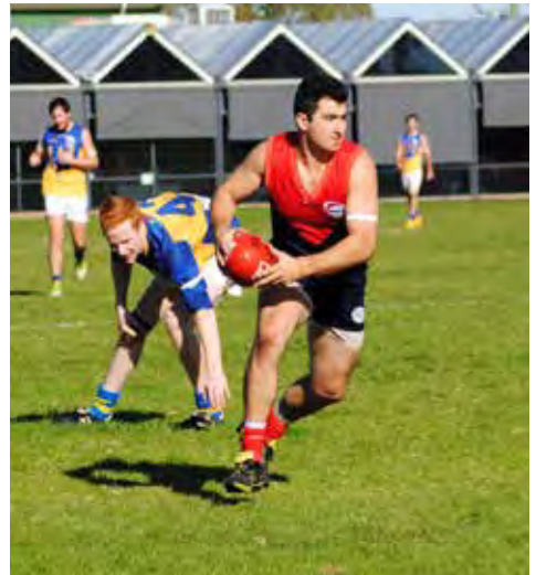
St Albans will take on Albion today at JR Parsons Reserve.

The Districts have this round's bye, and should use it to refresh and get ready for its charge at a premiership.