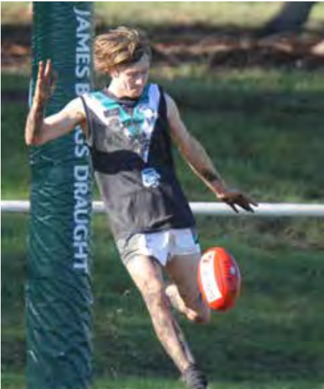
Newport Power will take on Sanctuary Lakes on Saturday.