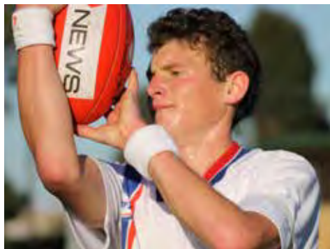
An umpire pays his respect during the WRFL's White Ribbon Round, wearing a white arm band.