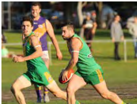
A couple of Spotswood players in action on Saturday at McLean Reserve.