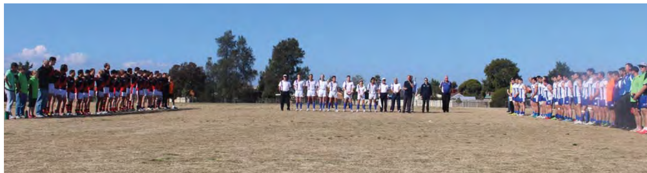
Division Three Senior Grand Final Day.