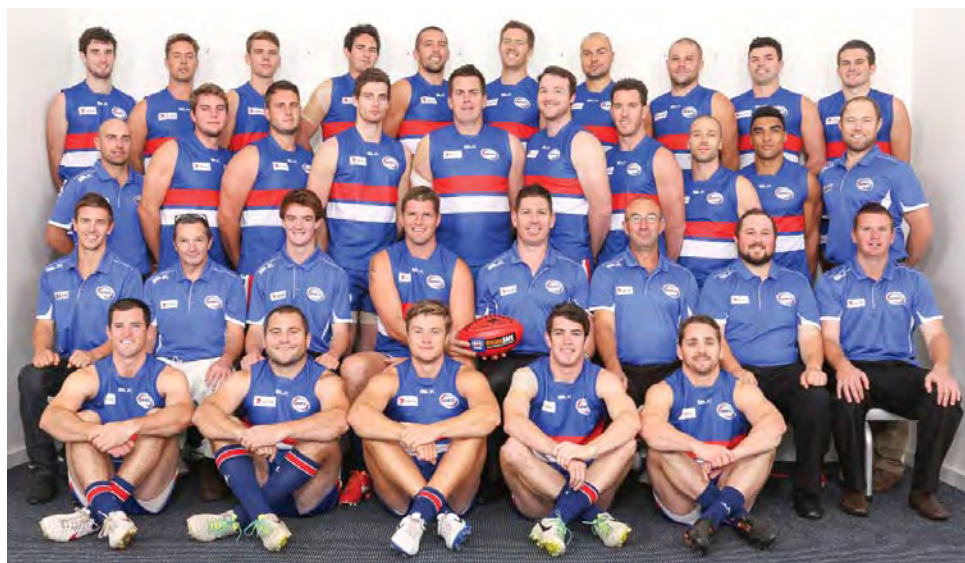
The 2014 WRFL Senior Interleague Squad.