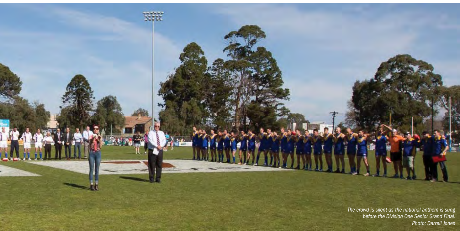
The crowd is silent as the national anthem is sung before the Division One Senior Grand Final.