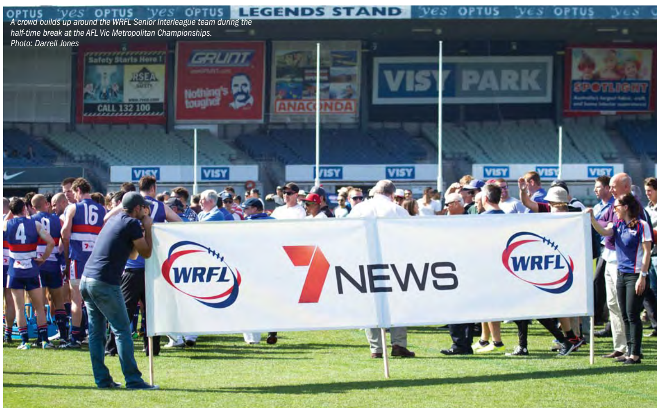
A crowd builds up around the WRFL Senior Interleague team during the half-time break at the AFL Vic Metropolitan Championships.

With the move to three senior divisions there were some changes to the structures with both the Division Two and Division Three competing in final four formats. The senior finals were played at Tarneit (Division Two), Hoppers Crossing (Division Three) and Avalon Airport Oval, Werribee (Division One and Division Two Grand Finals). The great weather across all junior and senior finals made for some terrific finals matches.