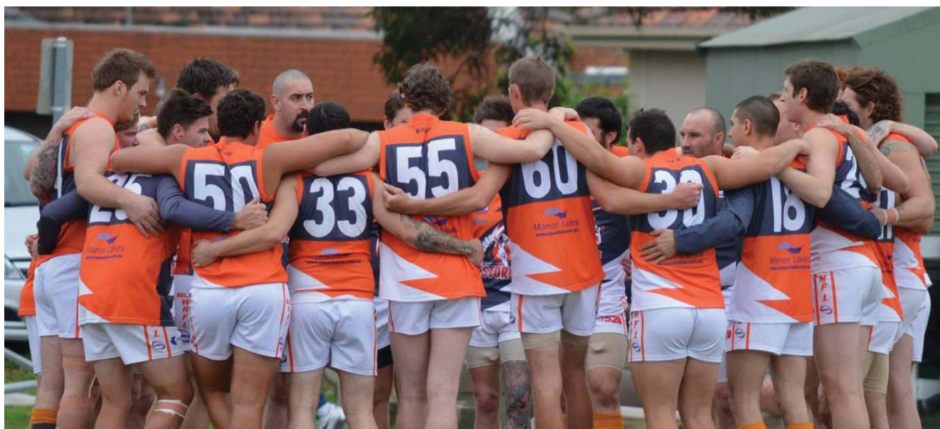
In its second year in the competition, Manor Lakes huddle together before the next quarter of football.

^^ Division Two (Section Two) competition conducted