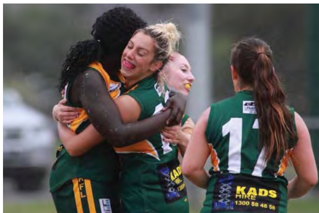
A couple of happy Falcon Youth Girl players embrace after kicking a goal.