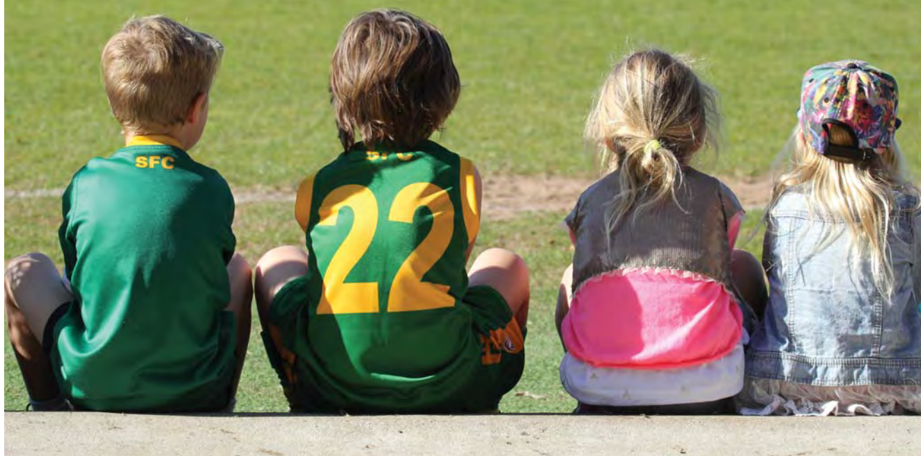
Some young football fans support their team from the sidelines.

One of the key deliverables of the 2010 Strategic Plan was to reduce the cost to member clubs of league affiliation fees. That has been achieved through