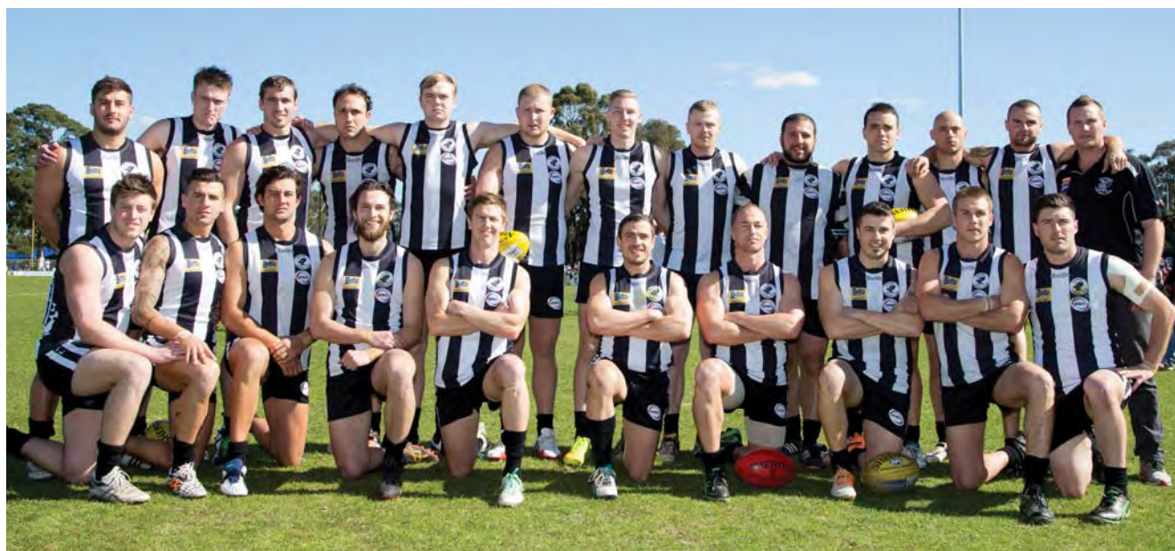
Division Two (Seniors): PARKSIDE