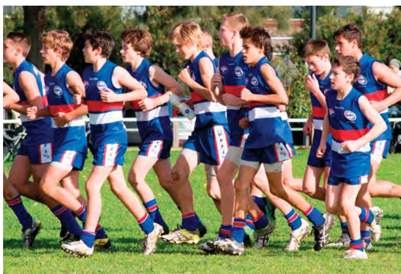
The WRFL Under 14 Division Two squad runs in as one at halftime.