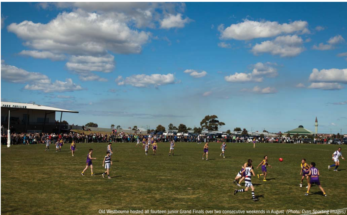
Old Westbourne hosted all fourteen junior Grand Finals over two consecutive weekends in August

of strong and measured recommendations in 2011. It is pleasing that when representing the Juniors Board each member is able to remove their 'club hat' and contribute to discussions and recommendations targeted at improving the league. The ability to assess what is the best action for the greater good cannot be underestimated and I congratulate each Juniors Board member for their work in 2011, and look forward to them again providing balanced and well thought out advice and direction for the junior competition in 2012.