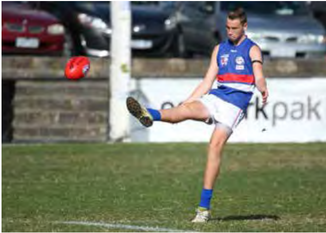
A WRFL representative player in action in the Under-15 Pool B match

In 2016 the WRFL introduced an Under-8 competition. Played under modified rules, this age group aims to provide children with a fun, safe and positive first 'competitive' football experience through a match program that develops their movement and basic football skills. The Under-8 division is expected to grow significantly in 2017, providing clubs with another strategy to increase participation by bridging the gap between Auskick participation and club football.