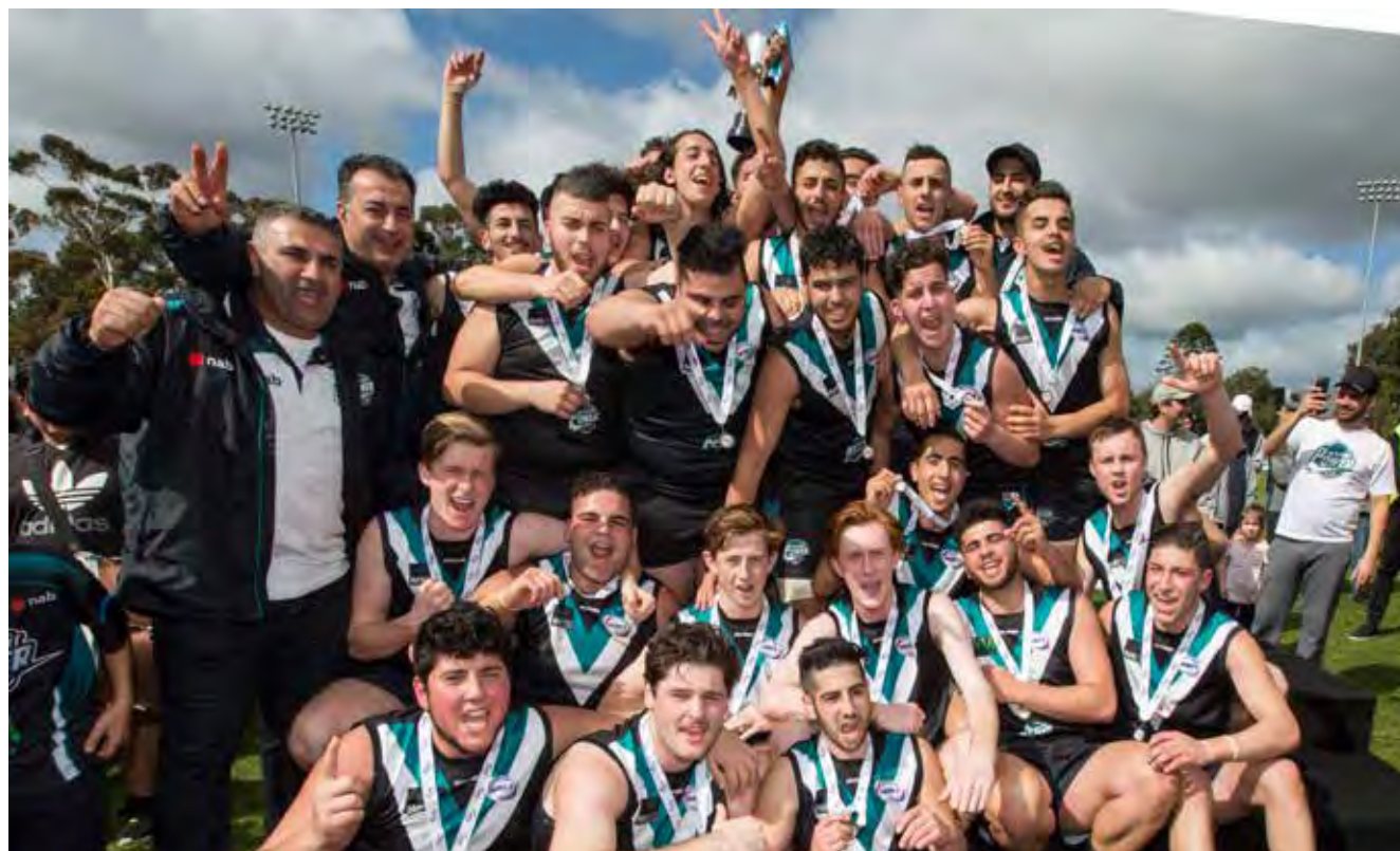
DIVISION TWO UNDER-19: NEWPORT POWER