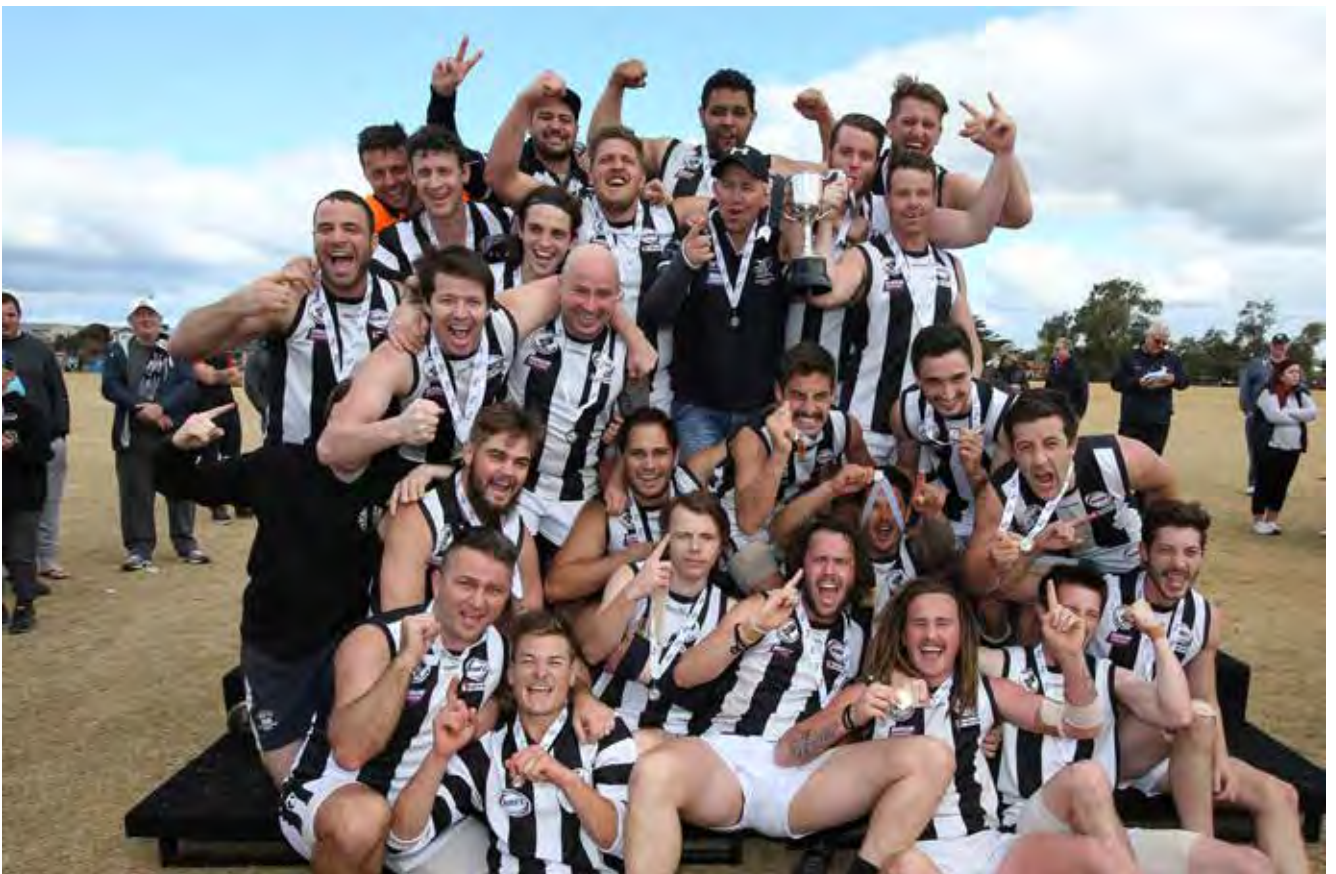
DIVISION THREE RESERVES: PARKSIDE