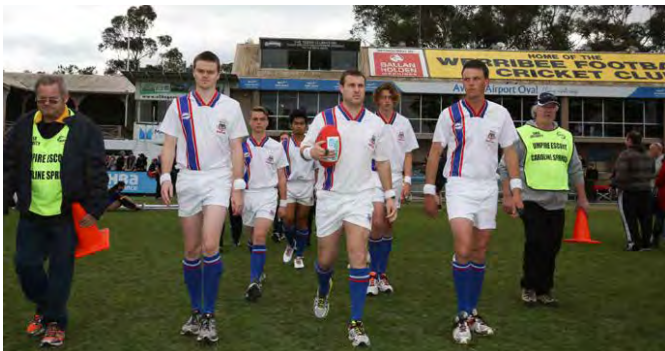
Umpires walk onto the ground to officiate the Division 2 Seniors Grand Final between the Yarraville Seddon Eagles and Caroline Springs at Chirside Park.