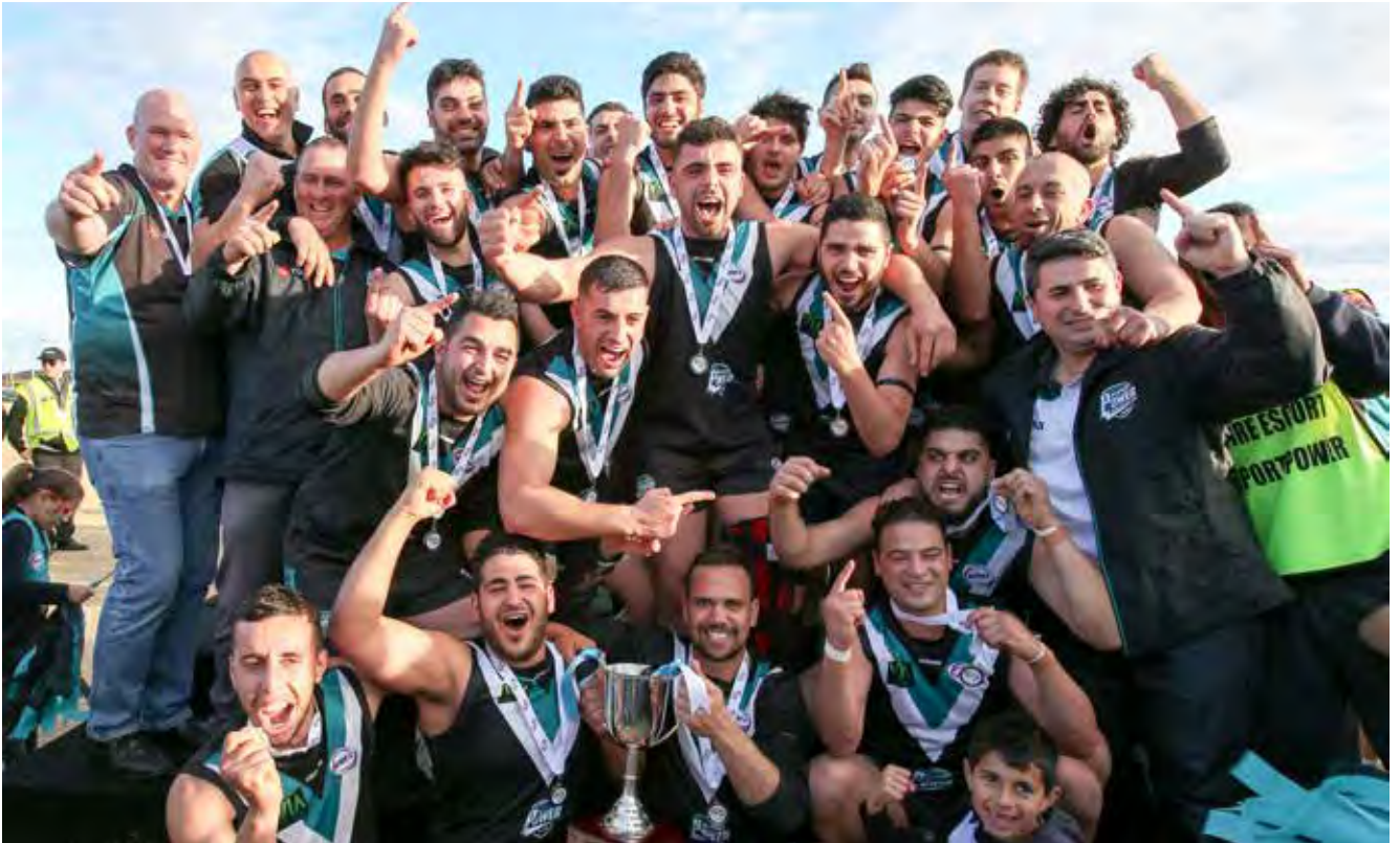
DIVISION THREE SENIORS: NEWPORT POWER