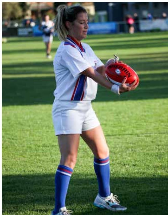
An umpire throws the ball in during the Round 3 Division 1 match between Spotswood and Hoppers Crossing.

Paul Dimartino (current VFL observer) stepped up during the season to replace Mark Mather and, not only provided excellent feedback and observation of umpires, but worked on the skill base of field umpires at various training venues.