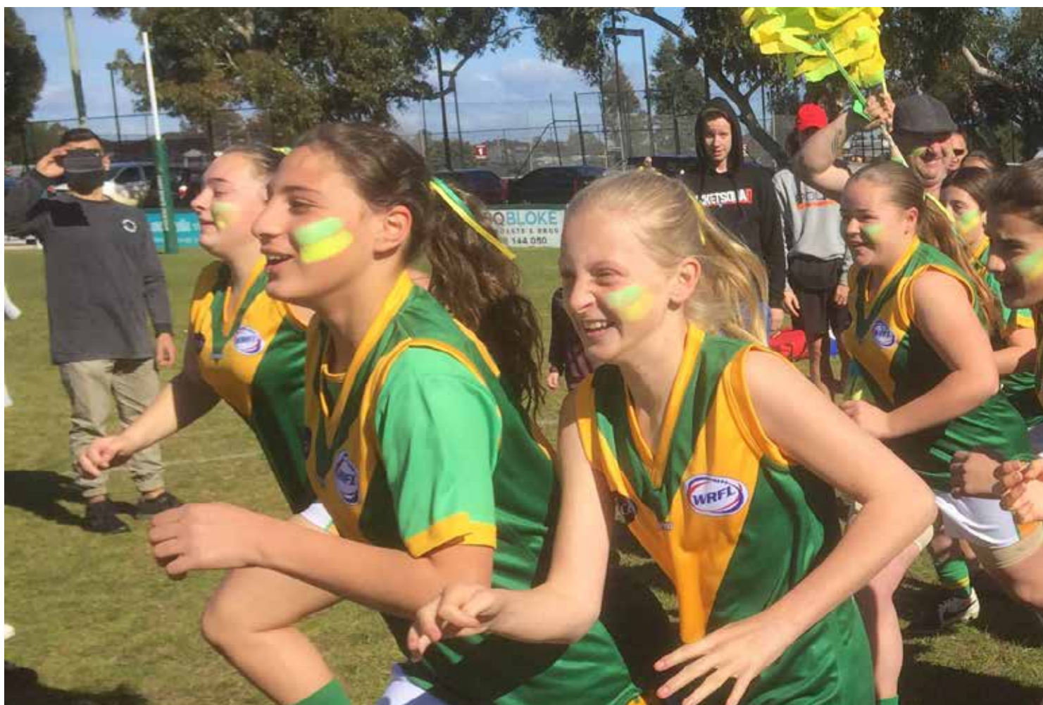
Spotswood's Under-15 girls team runs onto the ground for their Grand Final match with Keilor.

In line with the WRFL Strategic Plan, our Board has initiated an ongoing program titled "Respectful Cultures in the West".