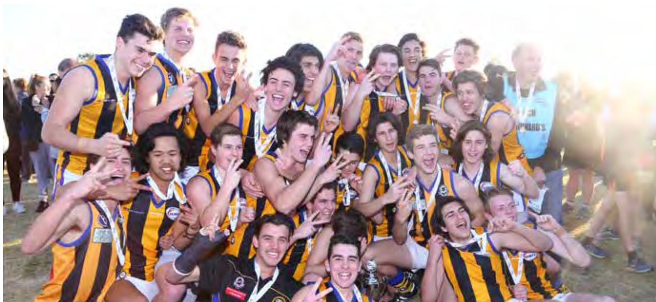
UNDER-17A: ST BERNARD'S