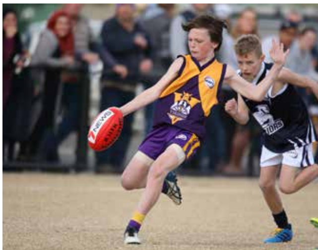
An Altona Juniors youngster gets a kick away during the Under-11 Grand Final.

Delivering a junior football structure in which young players can enjoy the game and develop their skills in competitions appropriate to their level of ability is a goal for all leagues and appropriate grading of teams is a crucial part in achieving this goal. Grading remains a challenge, given the differing levels of ability, size, development and movement of players that occur within each age