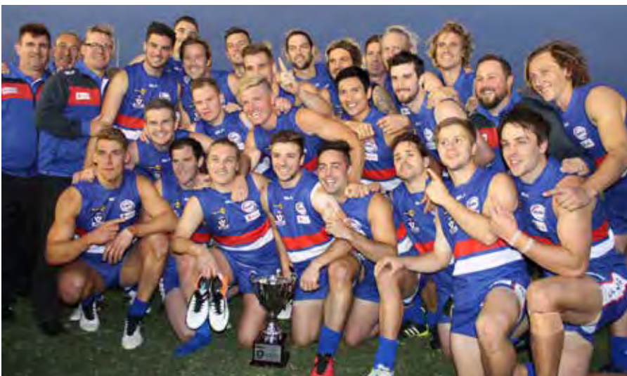
WRFL Senior's celebrate their three-point win over Ballarat FL as part of the Community Championships at Whitten Oval.