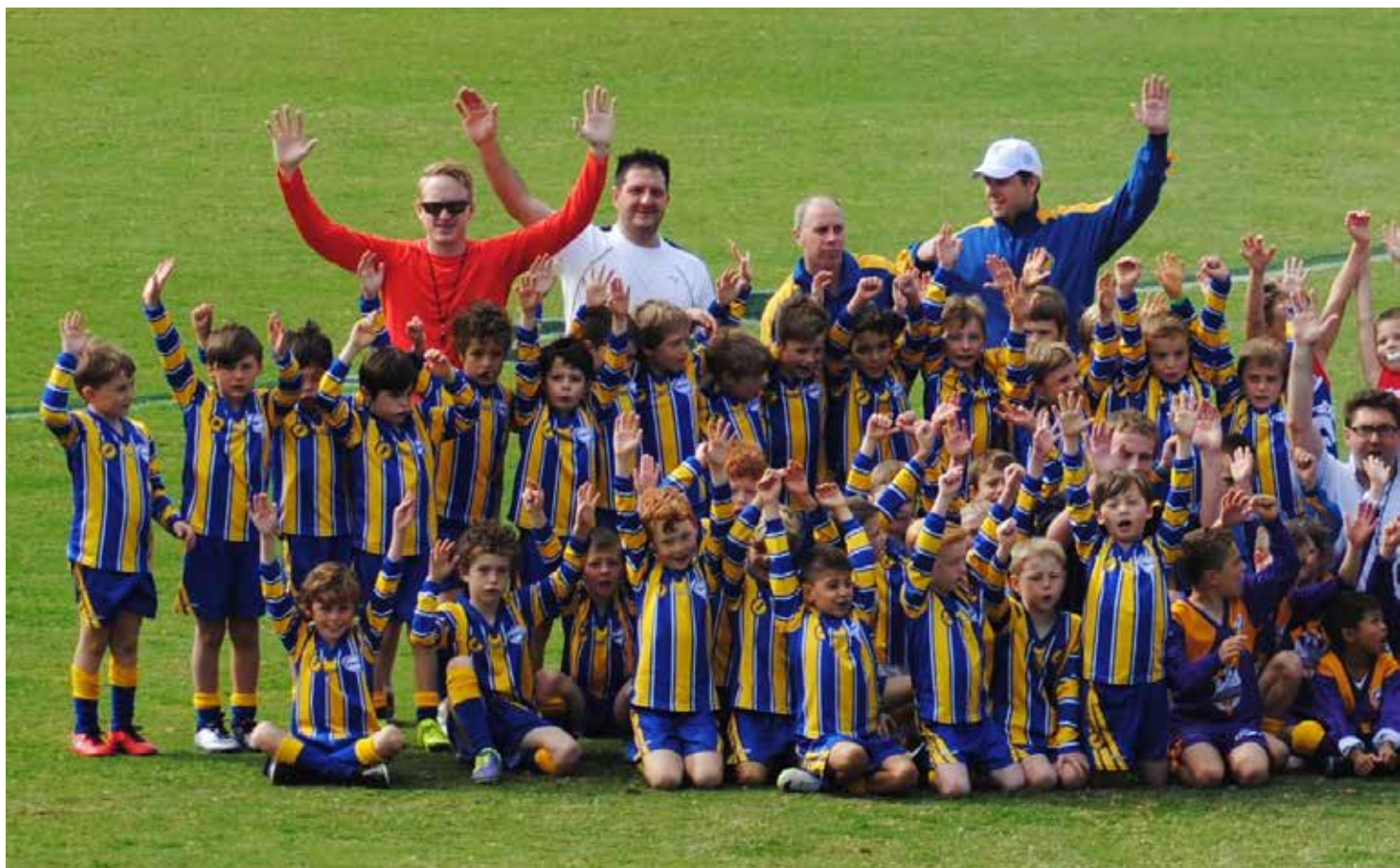
WRFL teams at the launch of the Under-8 competition at Whitten Oval at the beginning of the year.