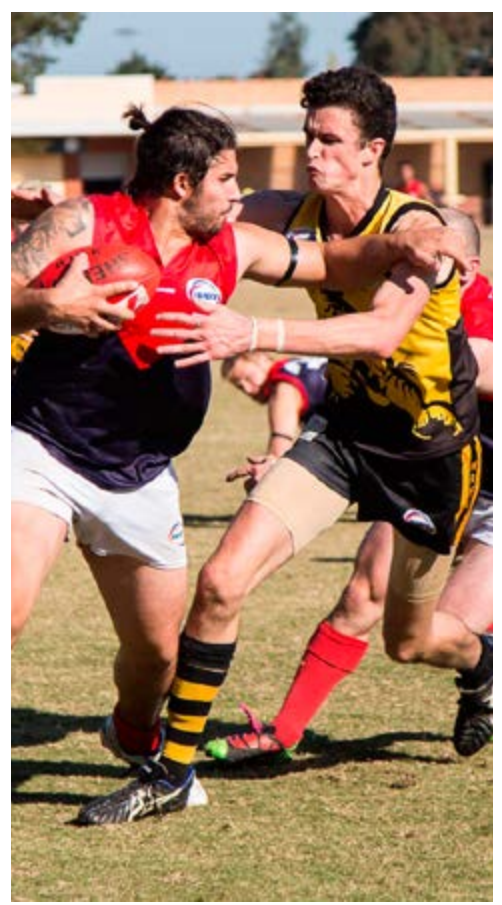
St. Albans fought off the Tigers last week to book their place in the second semi-final against Hoppers Crossing this Saturday.