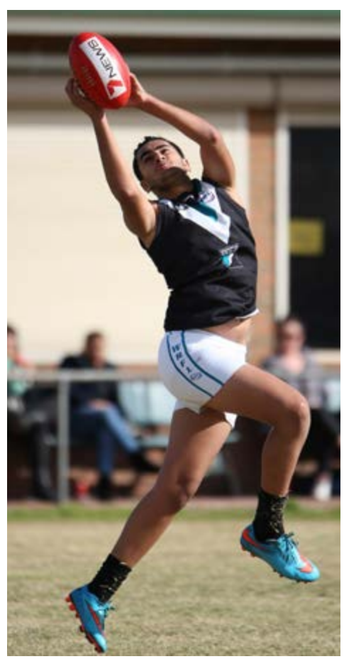
Newport weren't going to drop their match against minor premiers Werribee Districts last week, booking their place in the grand final.