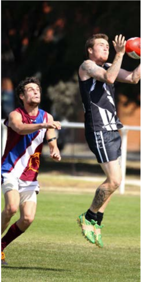
Laverton soared over the Titans last weekend to claim victory by 14-points.