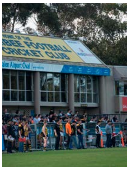
A big crowd turns up at Avalon Airport Oval for week #1 of the finals.