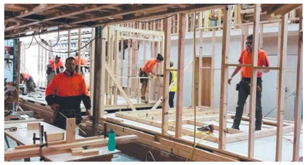
Acquiring industry-specific skills will set you on track to your chosen trade career.

Visit training.gov.au or call 9399 9511 or check out the TIV website http://tiv.vic.edu.au