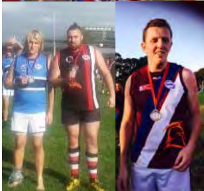
Best player medals were awarded to all Under 18, Reserves and Senior players in celebration of the inaugural 7NEWS Round.