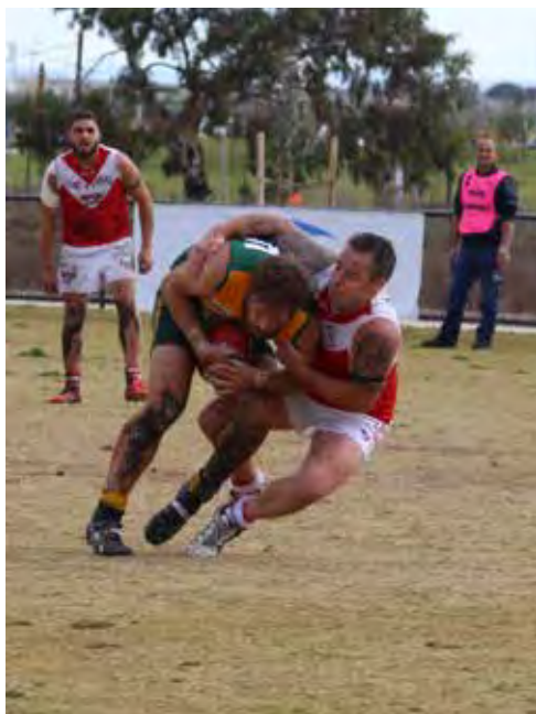
It was a muddy affair at the Falcon's Nest last Saturday as the battle of the birds saw Wyndhamvale come home trumps.