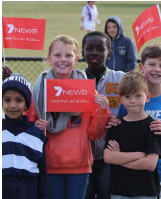
A number of kids enjoyed the Wyndhamvale Football Club family day last weekend.