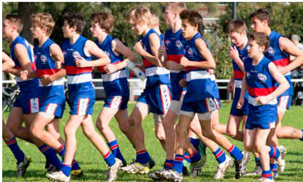
The Division Two Under 14s squad warms up before its clash against the YJFL in last year's carnival.