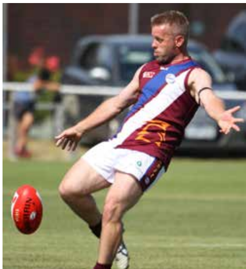
Tarneit's dominance in the forward line last week has helped secure third place on the ladder after chalking up its fifth win for the year over Parkside.