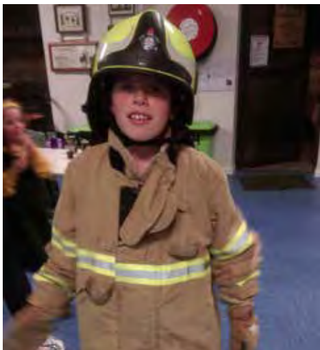
West Footscray FC held a Safety Night for its junior players last week where the kids enjoyed dressing up in all the safety gear.