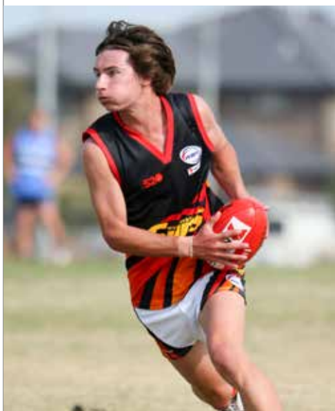
The Wyndham Suns were simply too good for the Magpies last week, marching home to a 32-point victory.