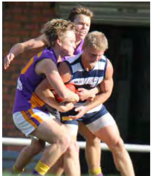
There was no getting out of this heavy tackle after two Viking players bear-hug their Albion opponent.