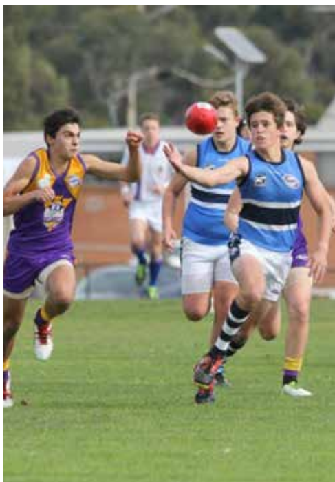
It's all eyes on the ball for these Under 14 players during their match last weekend.