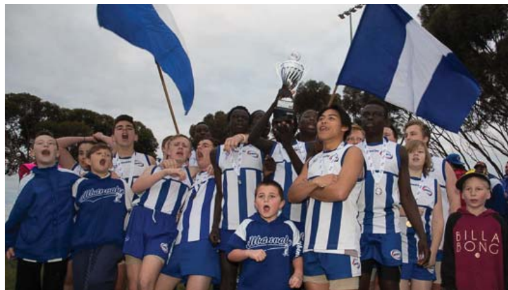
Under 16D Premiers- Albanvale.