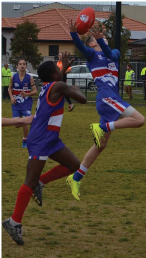
Right: What a great mark!