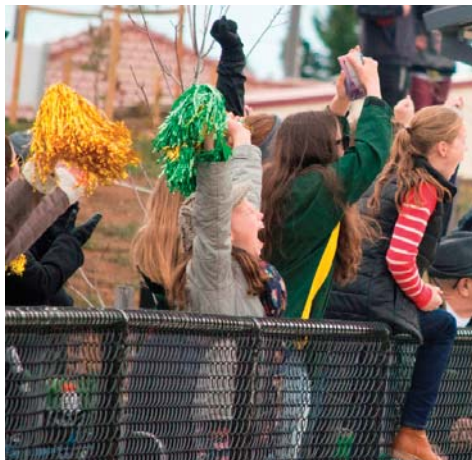
Right: The crowd goes wild when their favourite team scores a goal during the grand final.