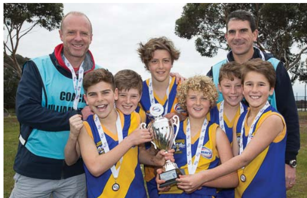
Under 12A Premiers- Williamstown Juniors.