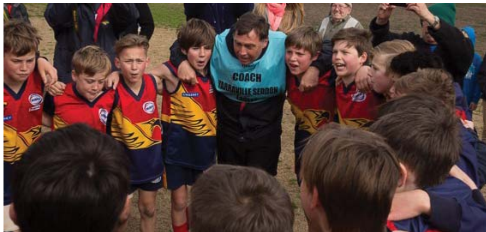
Below: The Under 12B Yarraville Seddon Eagles sing their song after the match.