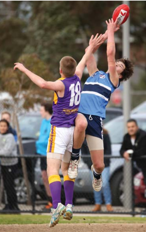
Above: Left: Below