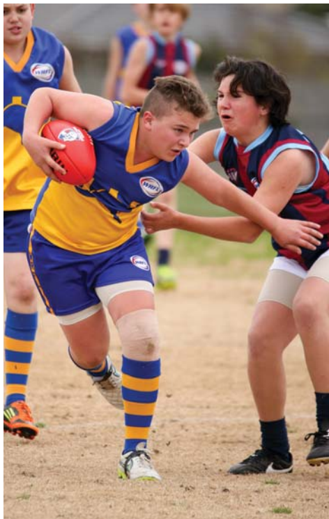
Sunshine and PEGS Juniors battle it out for the Under 13C Premiership.