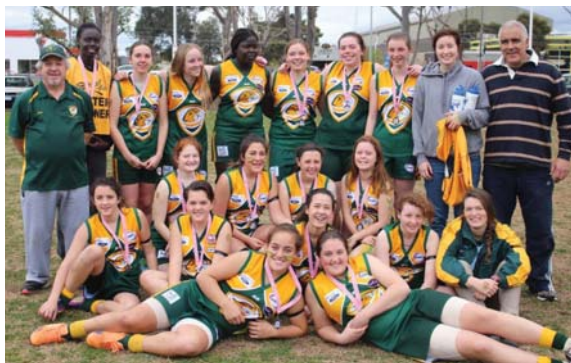
There were still smiles on the faces of the Wyndhamvale Youth Girls team after going down to Melbourne Uni in the Grand Final last week.