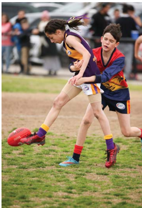
Above and Right: Below