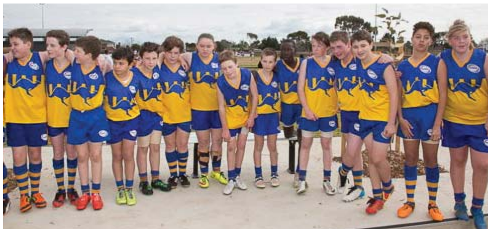
Below: The Sunshine Under 13 team line up to collect their medals.