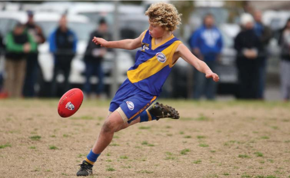
Above and below: Right: What we are all playing for.