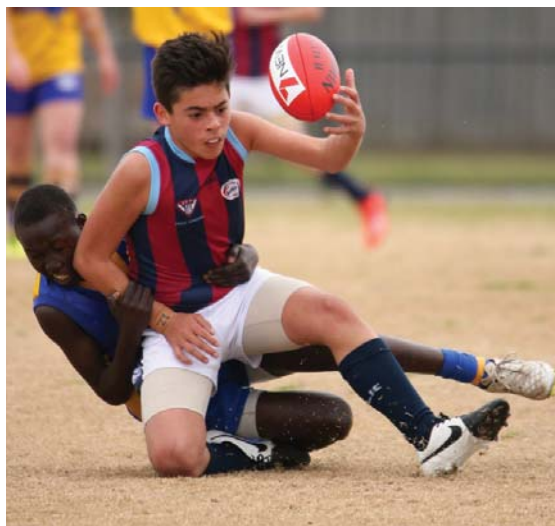
Above: Check out this great tackle from this Sunshine Under 13 player.