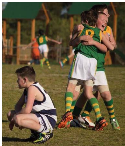
Above: The highs and lows of finals.