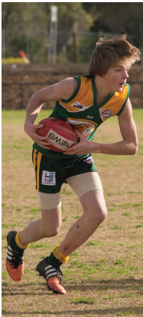
This Under 13s Falcon makes sure he tucks the ball under the arm and charges towards his forward line.