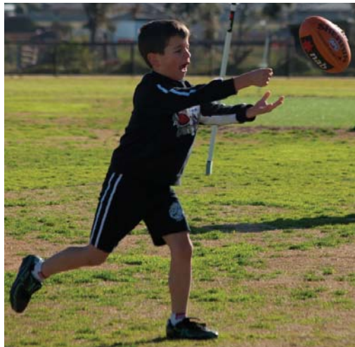
Above: Great to see our future stars practising their skills at Tarneit Auskick on the weekend.