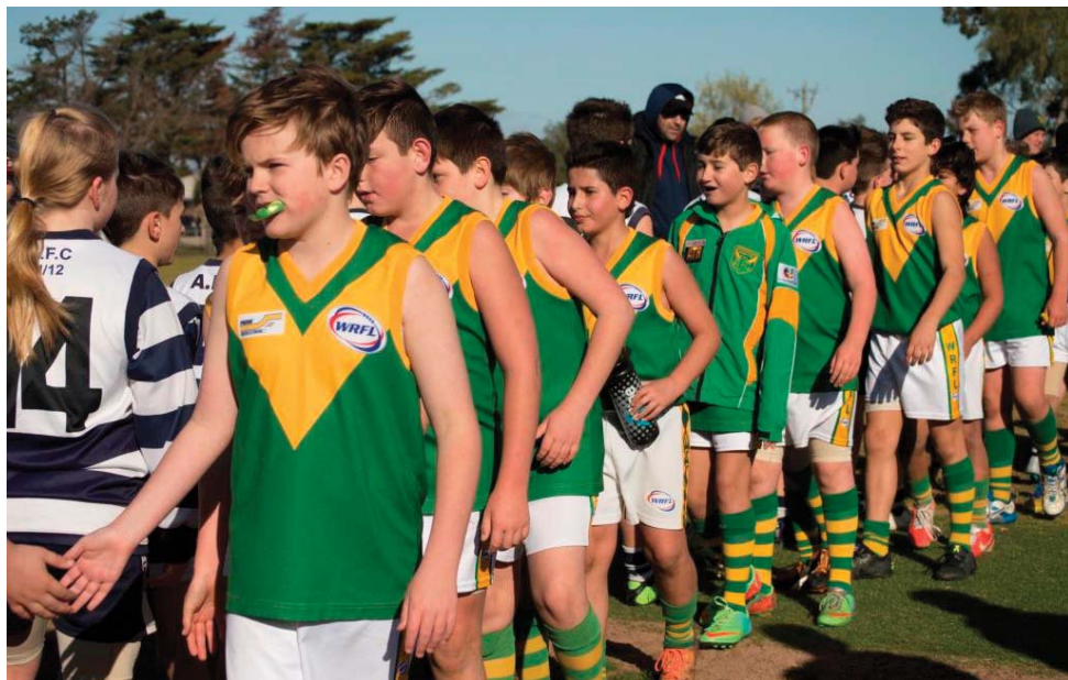
Spotswood and Albion Under 12s line up to shake hands after their match at Tarneit.