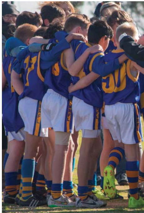
Right: The Under 11C Williamstown Junior players link arms to sing the song at the end of their semi-finals match last weekend.