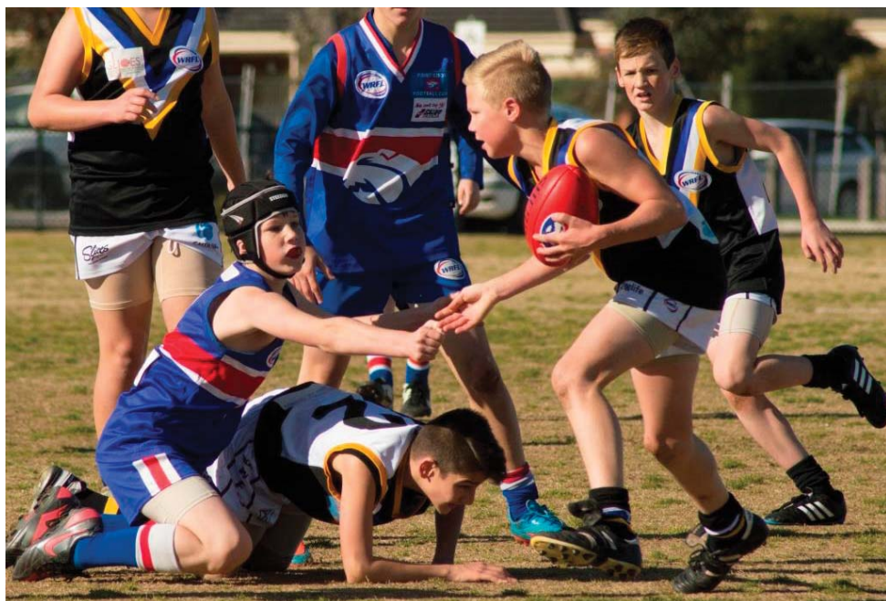
It looks as if these two Under 11 players from Caroline Springs and Point Cook are high-fiving each other as they come out of the contest.