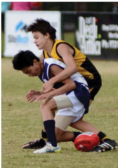
This Under 16s Tiger has his Hoppers Crossing opponent all wrapped up.