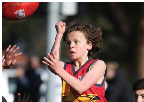
Have a look at the determination on the face of this young Eagle as he handballs the footy out of trouble.