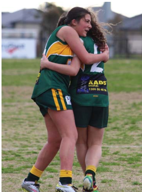
These Wyndhamvale Youth Girls were certainly happy with their performance after defeating Melbourne Uni last week to earn a place in the Grand Final.