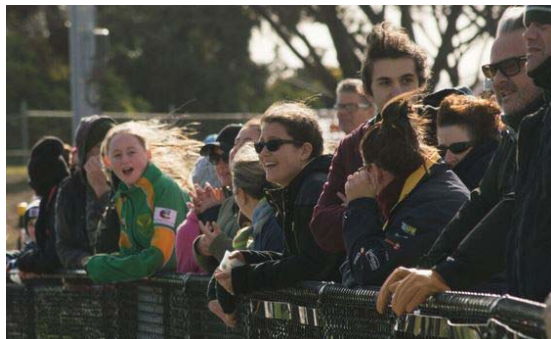
A big crowd gathered for the start of the WRFL Junior Finals Series ready to cheer on their favourite team.