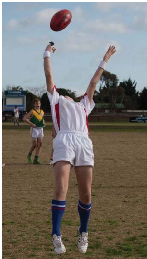
One boundary umpire arches the back as they throw the ball nice a high back into play at the Junior Finals on the weekend.

For more information on WRFL umpiring, visit our website www.wrflumpires.com.au