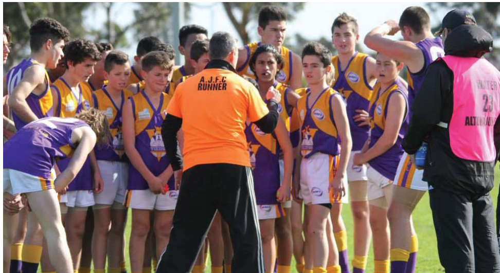
All eyes are focussed on the Altona Juniors' runner as they run out to play Sanctuary Lakes in the Under 14A second semi-final.