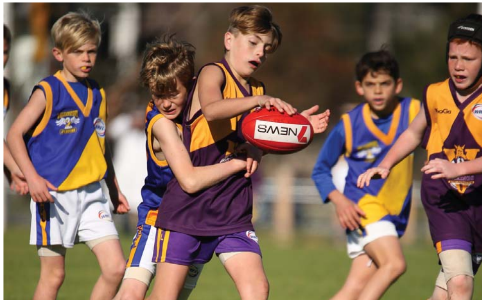
This Altona Juniors Under 11A kicks his kick away before a tough tackle by his Seagulls opponent.