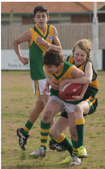
Check out this great tackle from this Under 13B Falcon on his Spotswood opponent during his semi final match last weekend.