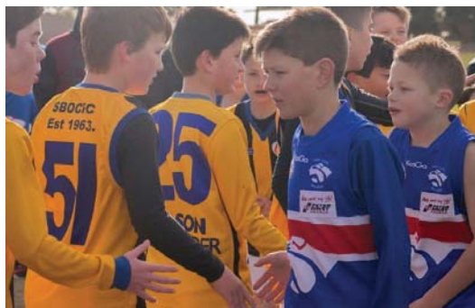
Win, lose or draw, it's great to see all juniors shake hands at the end of the game.