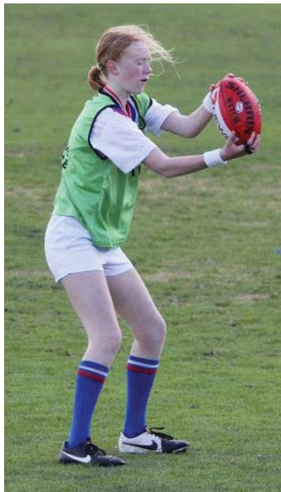
Great to see a number of green shirt WRFL umpires practising their craft over the weekend.