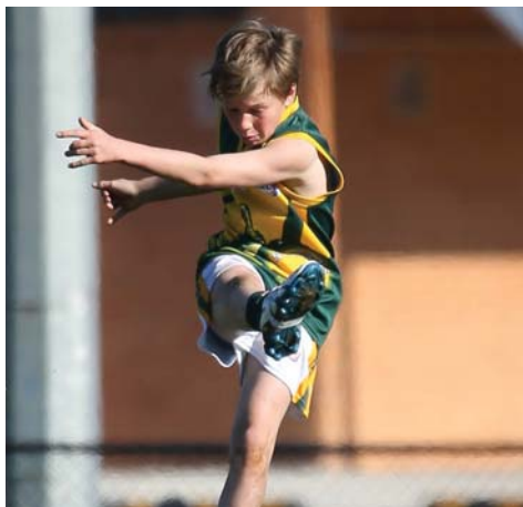
Check out this Under 12 Werribee Centrals player as he winds up for a huge drop punt.