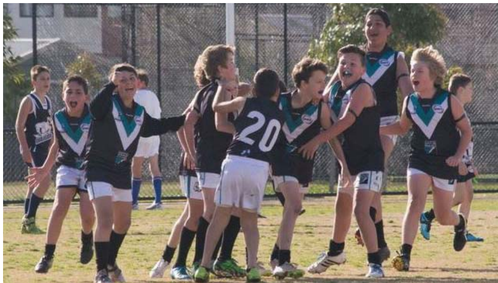
Newport Power jump for joy after coming from behind to clinch victory over Hoppers Crossing in the Under 12B Elimination Final.