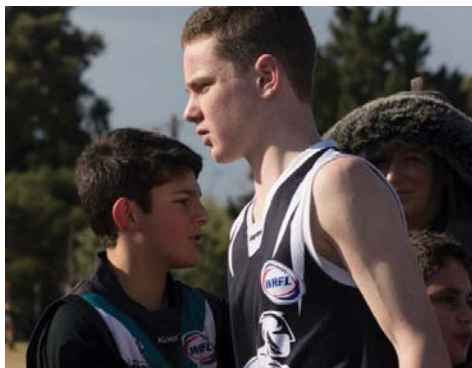
Newport Power and Hoppers Crossing shake hands after their finals encounter at Hogans Road last Sunday.