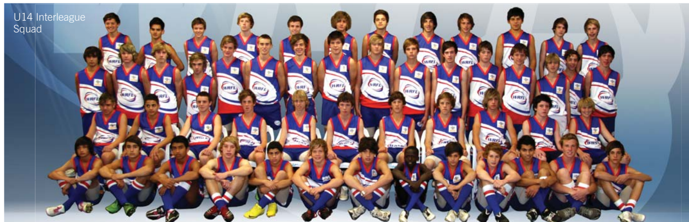
U14 Interleague Squad