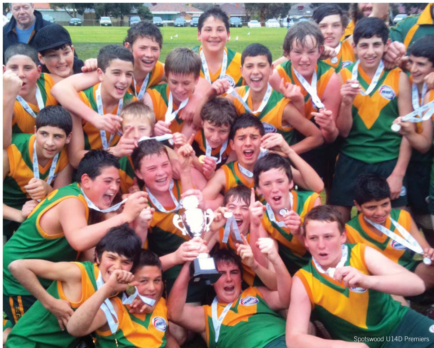
Spotswood U14D Premiers

The Association would like to thank the co-operation of all the WRFL Executive Board and staff for the progress we have made in 2010 and look forward to 2011.